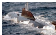
रूसी पनडुब्बी 'कशालोत' भारतीय नौसेना की ताकत बढ़ाएगी