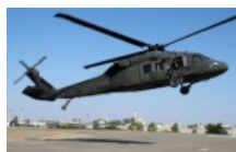
भारत और रूस मिलकर सैन्य-हैलिकॉप्टर बनाएंगे