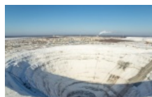
रूस के पाँच सबसे ठण्डे शहर