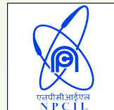
Nuclear Power Corporation of India