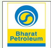
Bharat Petroleum Corporation Limited