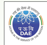
Dept. of Atomic Energy