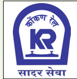
Konkan Railway Corporation Ltd.