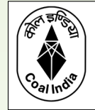
Western Coalfields Ltd.