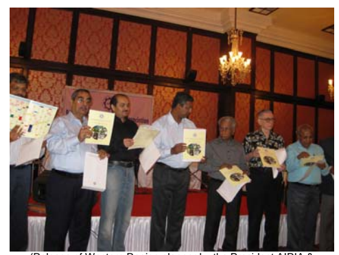
(Release of Western Region planner by the President AIRIA & Sr. Members of the Association)

The Western Region had also organized a Motivational Talk on "Unleash your Potential" and a musical entertainment program for the on the evening of 18<sup>th</sup> September 2010