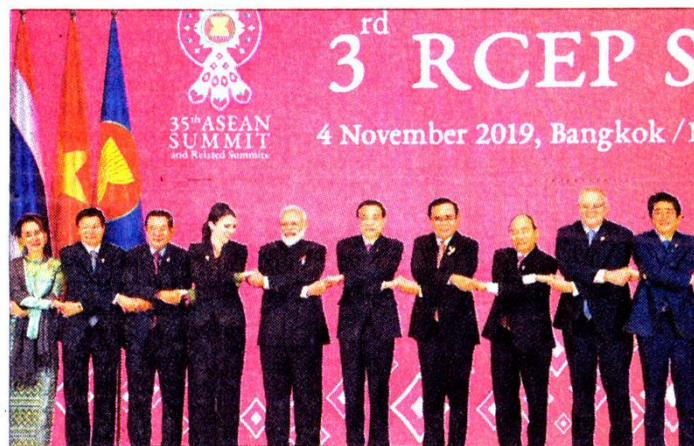
DELINKED: It is time to push for comprehensive engagement with the Indo-Pacific, while clarifying India's concerns which prevented it from joining the group.

There can be little doubt that the RCEP countries would have wanted India to be a member of the group: China too for economic and commer-