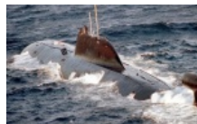
रूसी पनडुब्बी 'कशालोत' भारतीय नौसेना की ताकत बढ़ाएगी