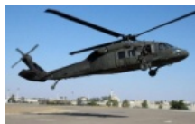
भारत और रूस मिलकर सैन्य-हैलिकॉप्टर बनाएंगे