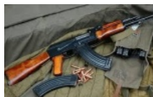
अब भारत में बनेगी एके-47 रायफल