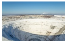
रूस के पाँच सबसे ठण्डे शहर