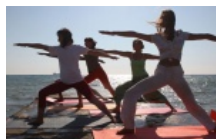
भारत के आकर्षण ने रूसियों को फिर घेरा