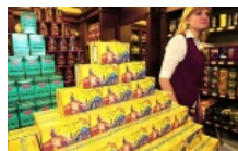
भारतीय चाय की चुस्कियों में डूबा रूस