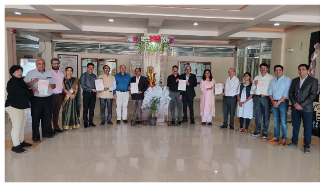
Nutan Maharashtra Vidya Prasarak Mandal (NMVPM), organized MOU signing event on

"Rubber Technology Course And Calibration Lab", on Saturday, 20th May 2023.